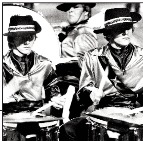
North Star snares (photo by Dick Deihl from the collection of Drum Corps World).

After a first tour where the corps never even got close to breaking 70, the members began to lose a little confidence. They finally broke 70 at DCI East, giving a little encouragement. Frustration set in at DCE Championships, where the corps placed fifth and missed 70 by 0.05.