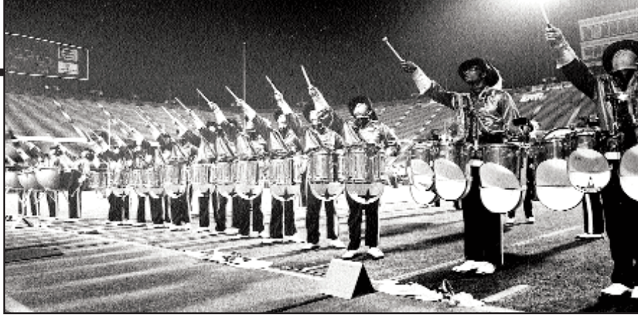
The "Chrome Wall" of North Star, 1978.

North Star came in second on the first day of prelims and 17th overall, earning a DCI associate membership. The members thought they deserved better, as they had beaten six of the corps that had placed ahead of them at DCI during the course of the season.