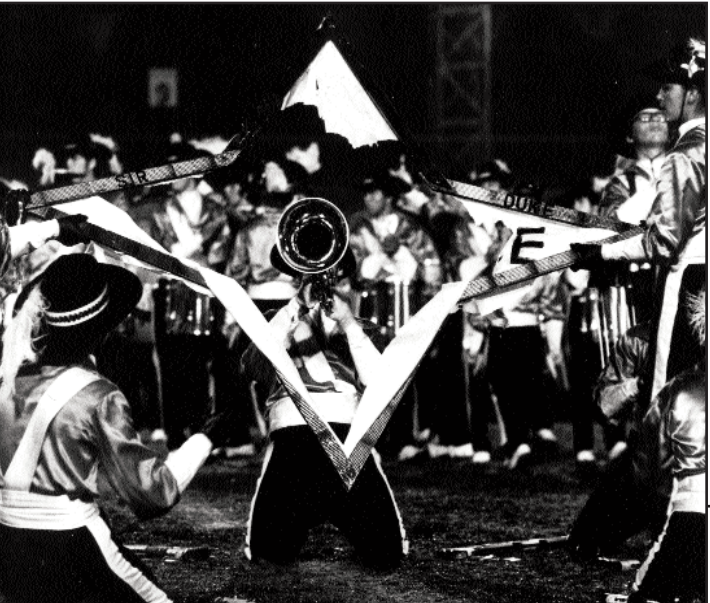
(Top to bottom) North Star rifles (photo by Moe Knox from the collection of Drum Corps World); I.C. Reveries at DCI East, 1975 (photo by Moe Knox from the collection of Drum Corps World); Beverly Cardinals, June 13, 1970 (photo by Ron Da Silva from the collection of Drum Corps World); North Star during Sir Duke, 1978 (photo by Jan Byer from the collection of Drum Corps World).

After the Cardinals and Reveries, the Blue Angels of Danvers, founded in 1961, had the