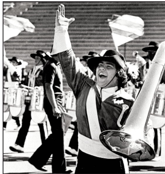
North Star at the end of Sir Duke, 1977.

The corps continued the tour, coming in 12th at VFW Nationals in New York City, making finals, and then competing at DCI in Philadelphia. Although the corps came in 30th, one place behind that of the Cardinals the year before, the members counted it a