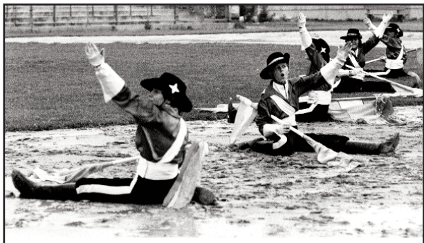
The muddy National Dream in Jersey City, NJ, August 24, 1979.

The author did not submit a photograph or a biography.