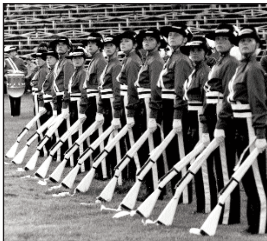
North Star rifles, 1980, at DCI Prelims in Birmingham, AL.

The 1975 season also saw the merger of the Reveries and Blue Angels. At the conclusion of the 1974 season, half of the Reveries left for the 27th Lancers. The remaining half merged with the now stronger Blue Angels to form the Blue Angel/Reveries, sometimes referred to as the "Blueveries." They met with moderate success, coming in 21st at the World Open.