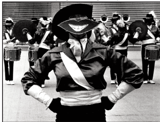
A North Star rifle smiles for the judges during Sir Duke, 1977.